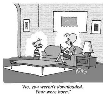
Figura 1. A typical figure

Figure and table captions should be centered if less than one line (Figure 1), otherwise justified and indented by 0.8cm on both margins, as shown in Figure 2.